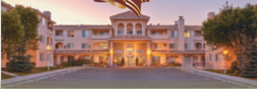
THE MANOR VILLAGE AT SIGNATURE PARK

The Community with Heart 403-249-7113 for your personal tour