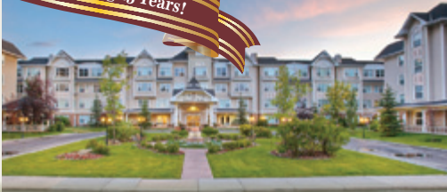
THE MANOR VILLAGE AT GARRISON WOODS

The Community with Heart 403-240-3636 for your personal tour